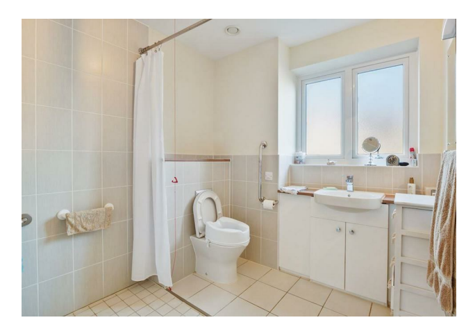
A beautiful and spacious TWO BEDROOM, upper ground floor apartment benefitting from a walk-out BALCONY and its own ALLOCATED CAR PARKING SPACE.